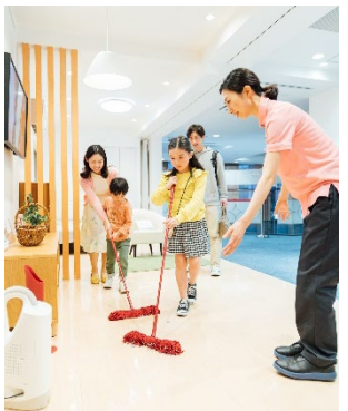
Cleaning Pavilion (2nd floor)