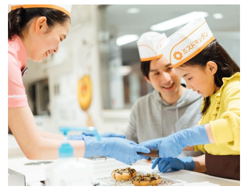
MISDO Museum (1st floor)