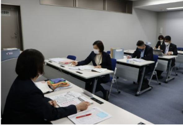
Training at Duskin School in Osaka, Japan