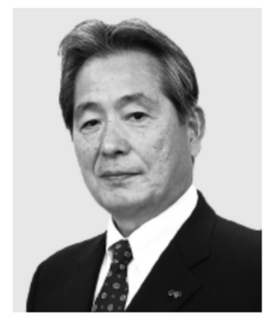
Reappointment Attendance at Board of Directors meetings during FY 2016: 26/26 100.0%